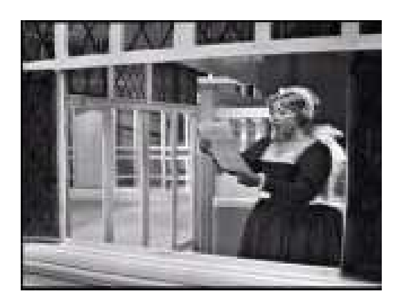
9. The walls revealing their artificiality