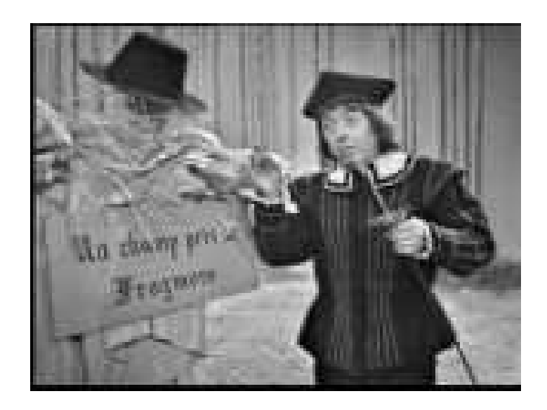
10. The scarecrow bearing a different sign to indicate each location ("Un champ près de Frogmore")