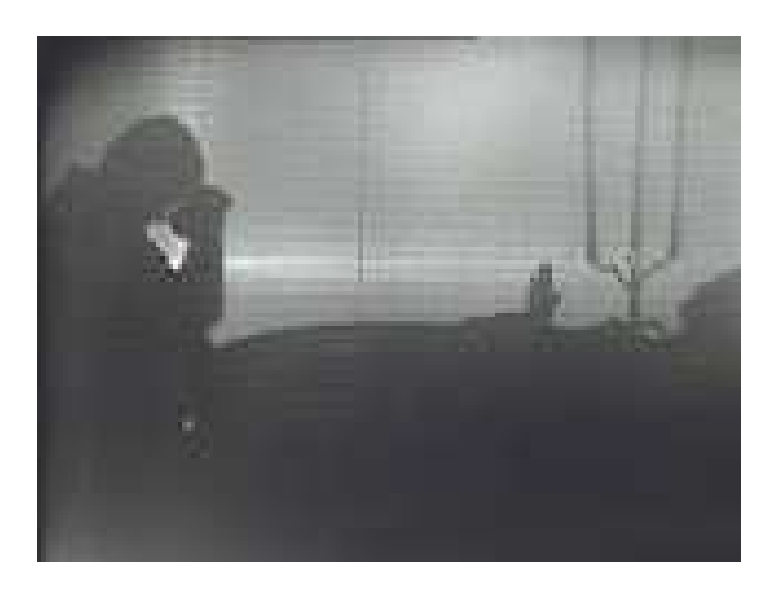
7. Claudio paying homage to Celia (Hero)