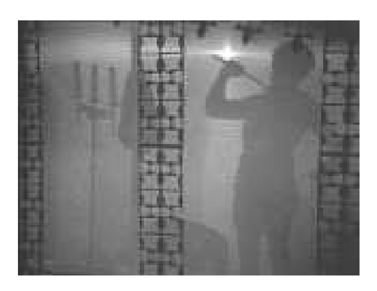
6. Benedick in the shower