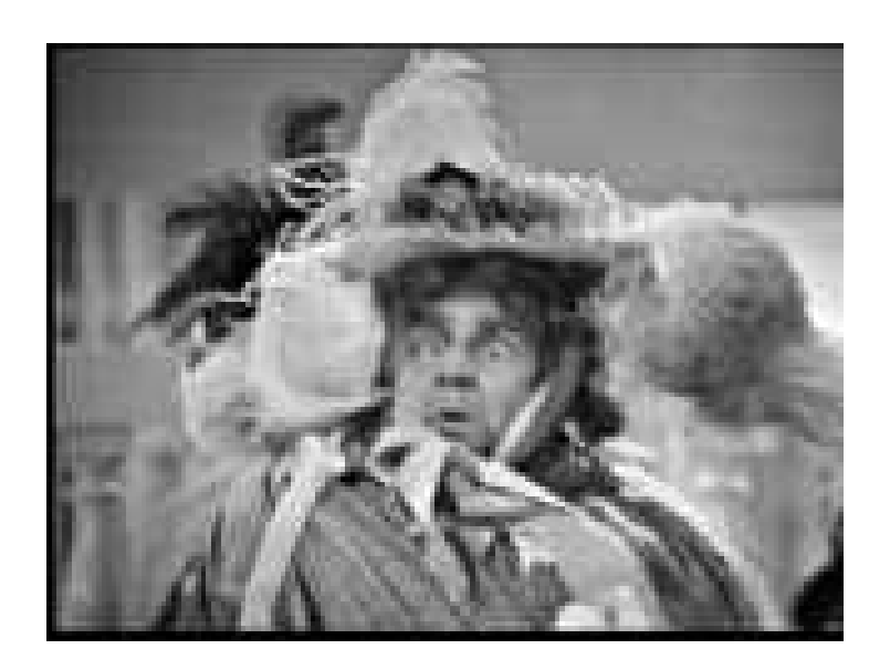
12. Falstaff disguised as the old woman of Brenford