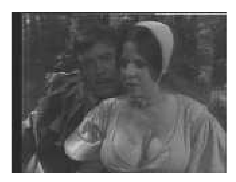
18. Touchstone and Audrey