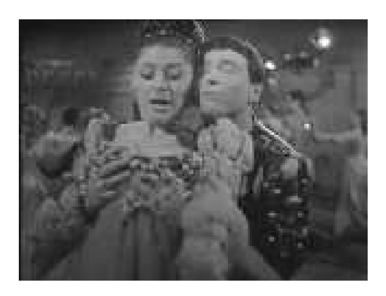
8. Borachio's bawdy game with Margaret