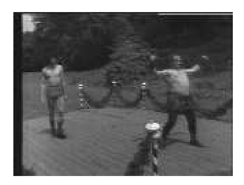
17. Orlando about to fight Charles the Wrestler