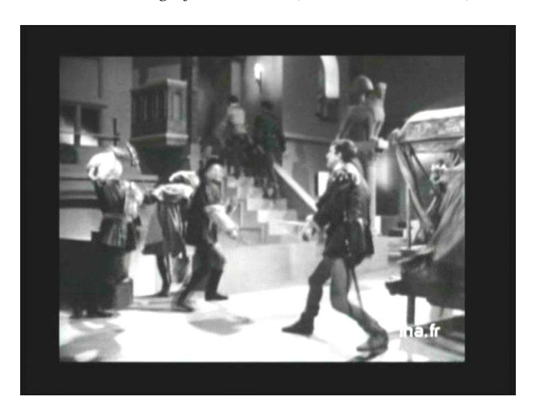
13. Filming The Shrew in the tradition of the swashbuckling movie