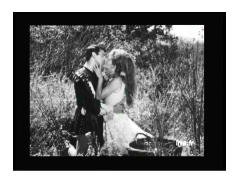
16. The romantic kiss concluding the film