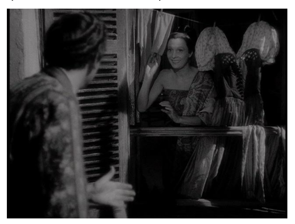
Fig. 5. Frédérick (Pierre Brasseur) and Garance play Romeo and Juliet

A few weeks later, we find ourselves in the Théâtre des Funambules, which is now staging Baptiste's new, more substantial pantomime, The Palace of Illusions, or Lovers of the Moon , in which Harlequin, played by Frédérick, steals the beloved of Pierrot, played by Baptiste. Baptiste has written an allegory of what has happened between him, Frédérick, and Garance, and the parts are played by the protagonists of the "real life" tale. The scene in the Funambules opens with a long shot of the packed audience then a reverse long shot of the stage from the audience's point of view. Carné never allows the film audience to forget that it is watching a film about watching. On the stage, we see Garance standing completely still on the right side of the stage wearing Greek robes and white makeup and holding a bow and arrow; she is Phoebe/Artemis, the goddess