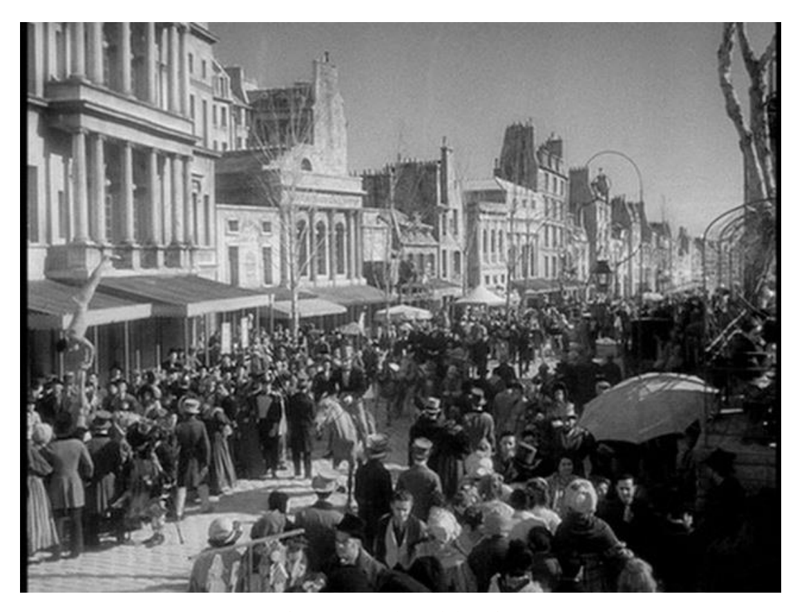
Fig. 1. Le Boulevard du Crime