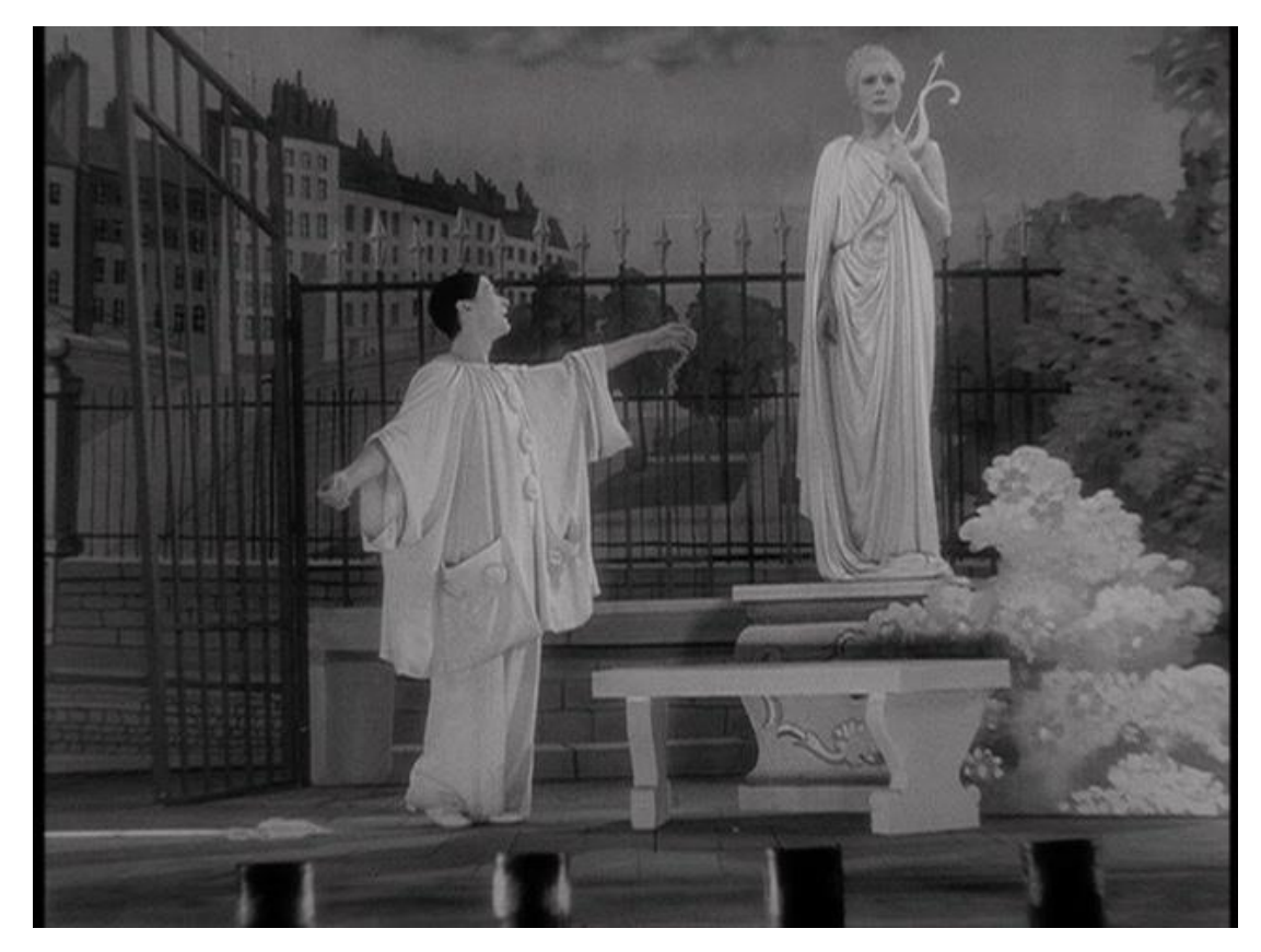
Fig. 6. Garance on stage as Baptiste's goddess

of the moon, the hunt, and chastity (fig. 6). She has been transformed into Baptiste's idol. Appropriately, she stands on a pedestal, revealing her to be a monumental statue. This view of Garance is linked to the opening shot of her in the film, the high-angle view of Garance sitting completely still in a spinning tub, staring at herself in a mirror, playing the role of "Naked Truth." In that shot, she is like the bathing Diana who draws forbidden mortal eyes — although, all through the film, she is hunted rather than hunting — as well as the wanton goddess of love tempting her audience. Baptiste's vision of Garance in his pantomime links the mythological icons of Diana and Venus. Carné encourages us to see Garance as a monument with a low-angle medium shot of her that gazes up at her imposing elegance and powerful beauty. Baptiste's Garance, as she stands on the plinth on stage, is precisely this, an exhibition of Baptiste's idealized desire. However, as his pantomime continues, Garance/Phoebe, like Galatea and Hermione before her, steps off the pedestal and into the life of a male partner. Unlike the other two, though, Garance/Phoebe betrays her husband or creator and comes alive for the interloping, facile Harlequin, played by Frédérick. This treachery reveals her to be the lascivious Venus rather than the Phoebe/Diana she appeared to be (to Baptiste).