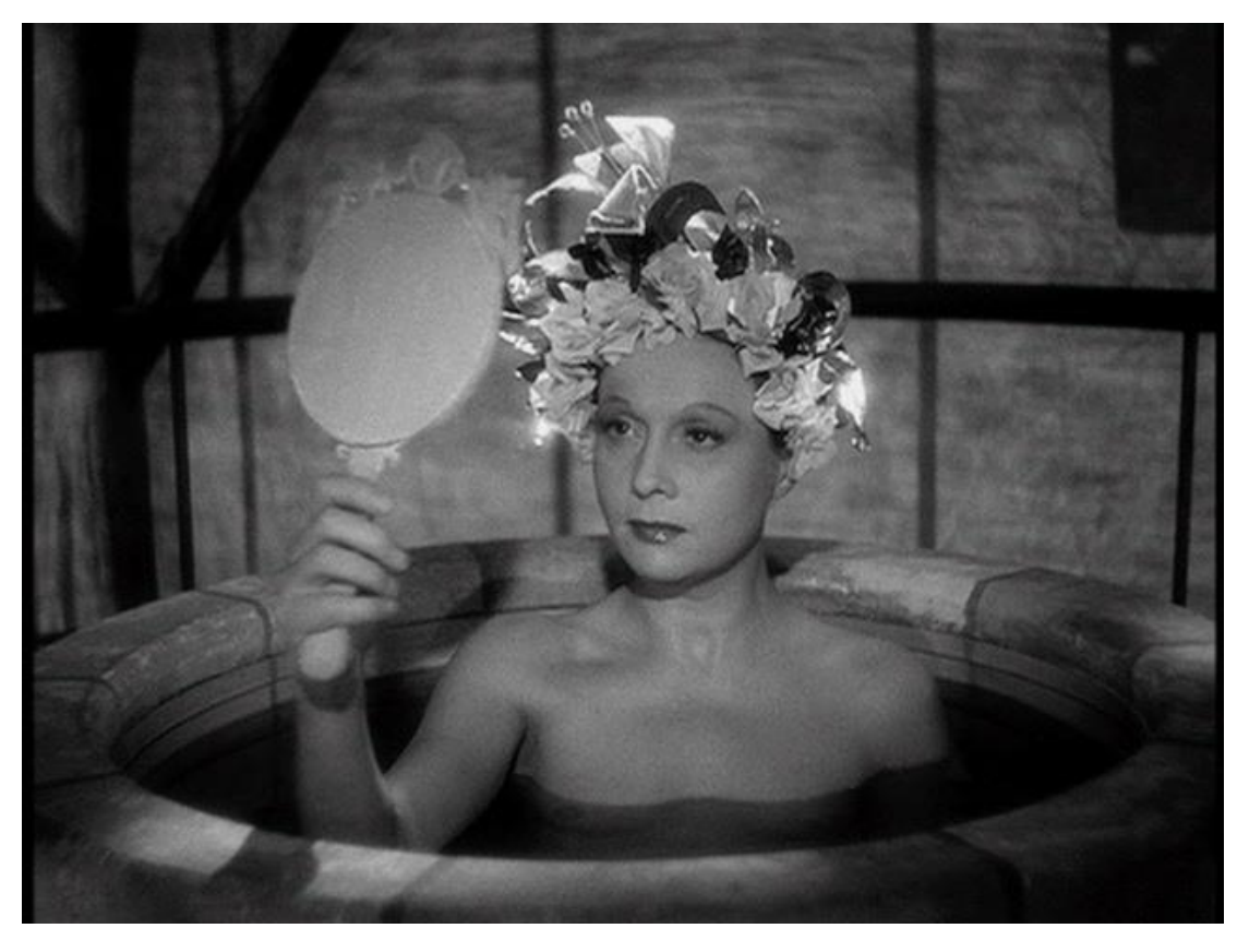
Fig. 2. Garance (Arletty) playing Naked Truth