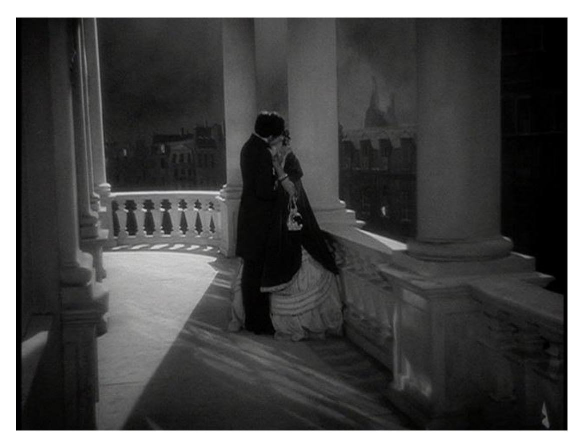
Fig. 8. The passion of Garance and Baptiste in the second balcony scene