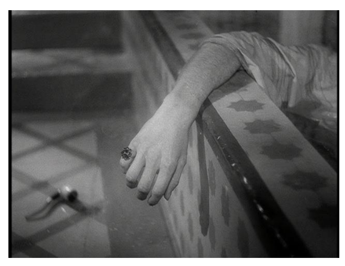
Fig. 12. The Count de Montray assassinated in the Turkish bath